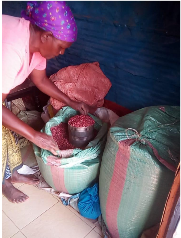
Fidelis Wanjiku is a food vendor in Huruma. COVID affected people's income in the village and as a result, she lost many clients too as the people purchasing power went down. We boosted her with one sack of beans.